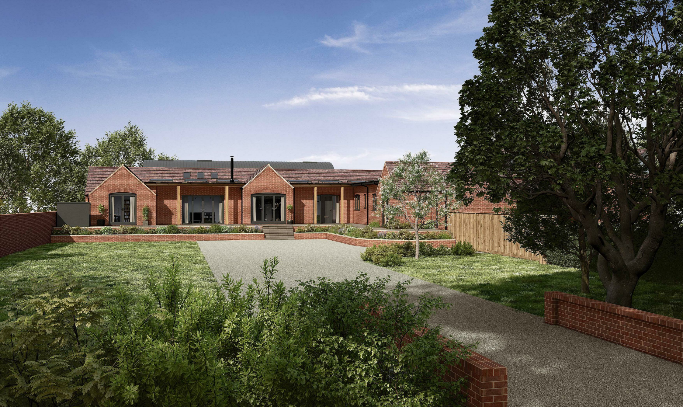
Nolands Courtyard, Oxhill CV35 0RJ